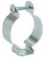
With Bolt And Nut